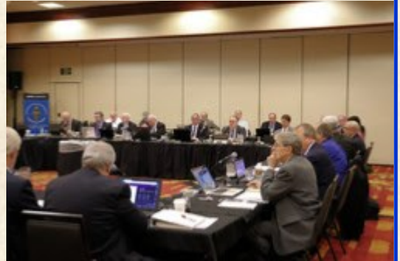
The ARRL Board met January 17-18 in Windsor, Connecticut.

The Commission anticipates auctioning this spectrum to expand commercial use of 5G cellular and wireless broadband services, if agreement can be reached on relocation of—or sharing with—the federal incumbents that operate in the same band.