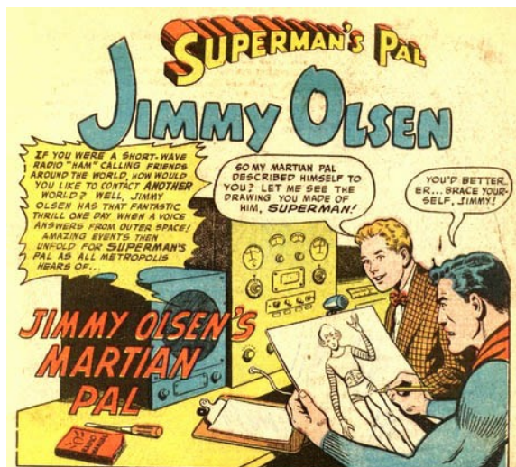
Superman and Jimmy Olsen have a QSO with a "Mars" station.

Artists and writers are quite aware about the potentiality of amateur radio. The innovative ideas of the creator of the famous comic strip hero 'Phantom' can be seen in his comic books. In these comic strips, Lee Falk illustrated how Phantom operates his radio station from deep inside the jungle and how his short wave wireless message gets tied to the telephone line (hams call it telephone patching) with the help of a ham by the name of Oscar ( how original -ed. ). Every ham radio operator has got his own "handle" (name). Phantom's handle is 'Kit!' ( sounds a bit like CB -ed. )