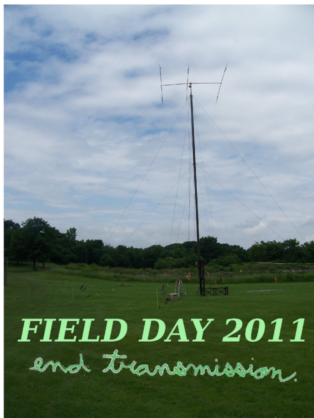
During the down time, I just talked ham radio with