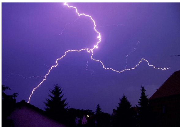
Photo does not represent the actual storm.