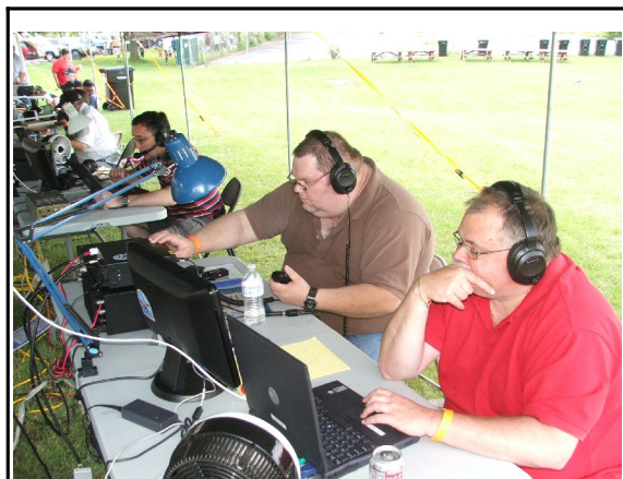
Ham operators making contacts early on during Field Day 2011 at the TARA FD site, June 25, 2011

ARRL Field Day is the single most popular on-the-air event held annually in the US and Canada. Each year over 35,000 amateurs gather with their clubs, friends or simply by themselves to operate.