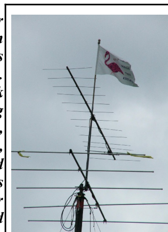
2 meter and 6 meter beam antennas with TARA banner flying on top just before start of Field Day activities, June 25, 2011.

air to make a few contacts with other Field Day participants from around the USA and Canada. Next Field Day will be on June 23-24, 2012.