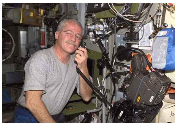
Contact on the International Space Station

handheld transceiver. An excellent place to start is the AMSAT-NA FAQ page. AMSAT, or the Radio Amateur Satellite Corporation, has played a key role in building, launching, and using amateur satellites. Occasionally, Radio Amateurs can talk with the astronauts on the