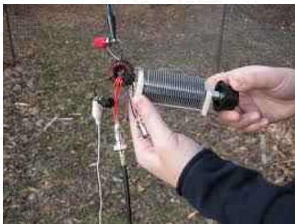
End-Fed Half-Wavelength Antenna (EFHWA)

Below is a photo on the finished EFHWA of one of her projects.