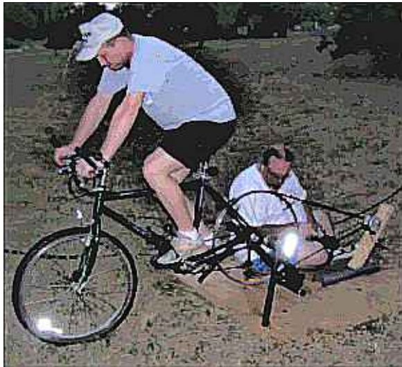
Using bicycle power to charge a battery.

Thus, the science of sitting affects our health negatively.