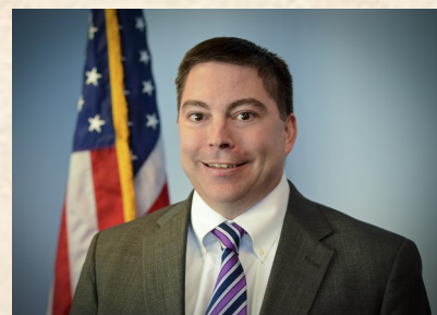
Commissioner Michael O'Rielly

"On a larger scale, complaints about the ALJ process are not isolated incidents, but paint a picture of questionable decisions coupled with an elevated level of inefficiency," O'Rielly said in comments attached to the MO&O. "It seems to me that, too often, the Commission has had to reverse the decisions of the ALJ or address one ALJ decision or another. This reality only reaffirms my call to consider eliminating the ALJ process altogether."