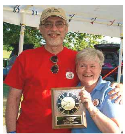
outstanding leadership and contributions to...Field Day operations".