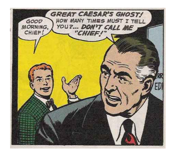
A clearly perturbed Perry White is pictured above imploring the ghost of Caesar to stop Jimmy Olsen from uttering the dreaded "C" word.

Perry White is (was? still is??) a fictional character who appears in the Superman comics, TV shows and in film. White is the Editor-in-Chief of the Metropolis newspaper the Daily Planet .