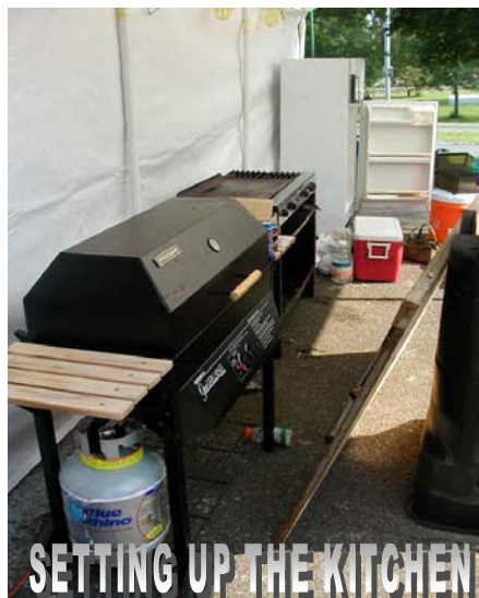
SETTING UP THE KITCHEN